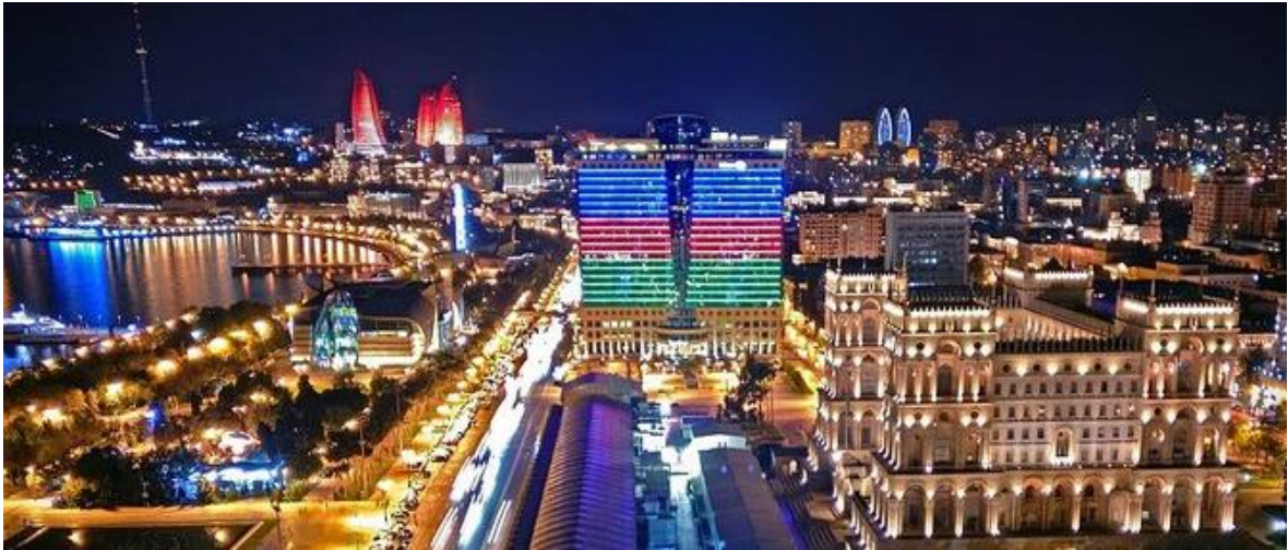
Caspian Sea Bay, Baku (TV tower, Flame Towers, Hilton Baku hotel, House of Parliament)