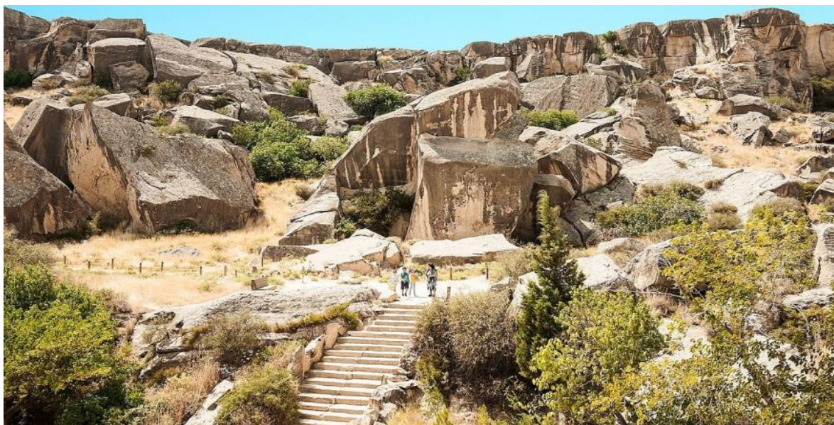
Gobustan petroglyph site