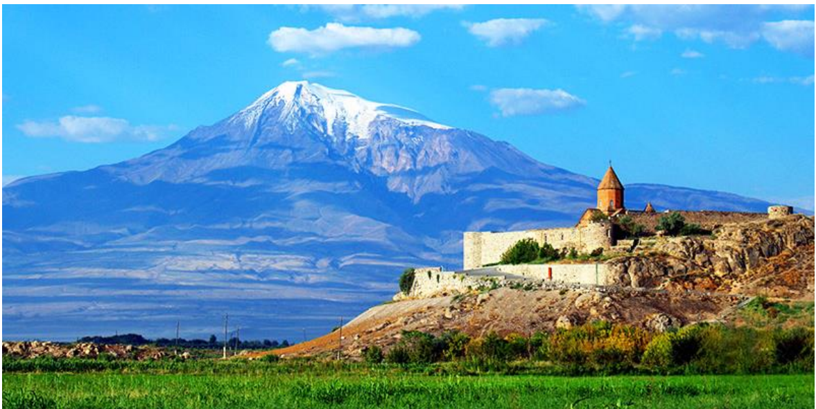
View of the Biblical Mount of Ararat (situated in Turkiye) and Khor-Virap monastery