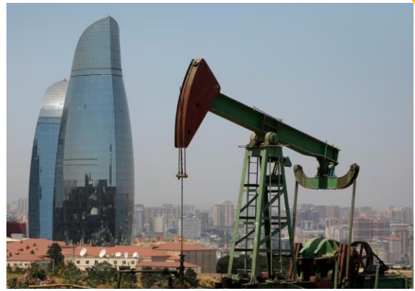
Black gold of Azerbaijan: black caviar and oil