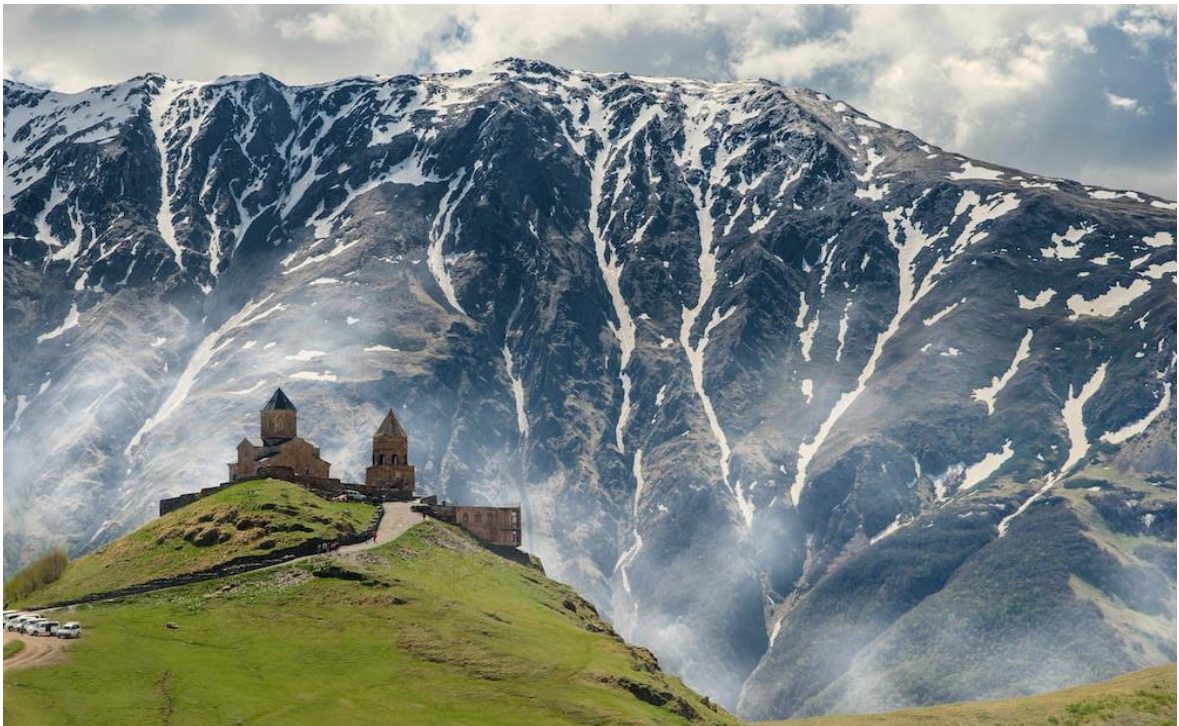
Gergeti Trinity Church in Kazbegi