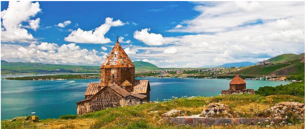
Sevanavank Monastery on Sevan Lake