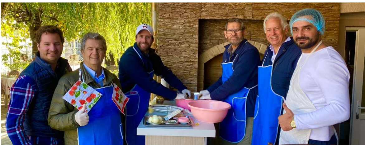
Cooking master class at a local family in Azerbaijan