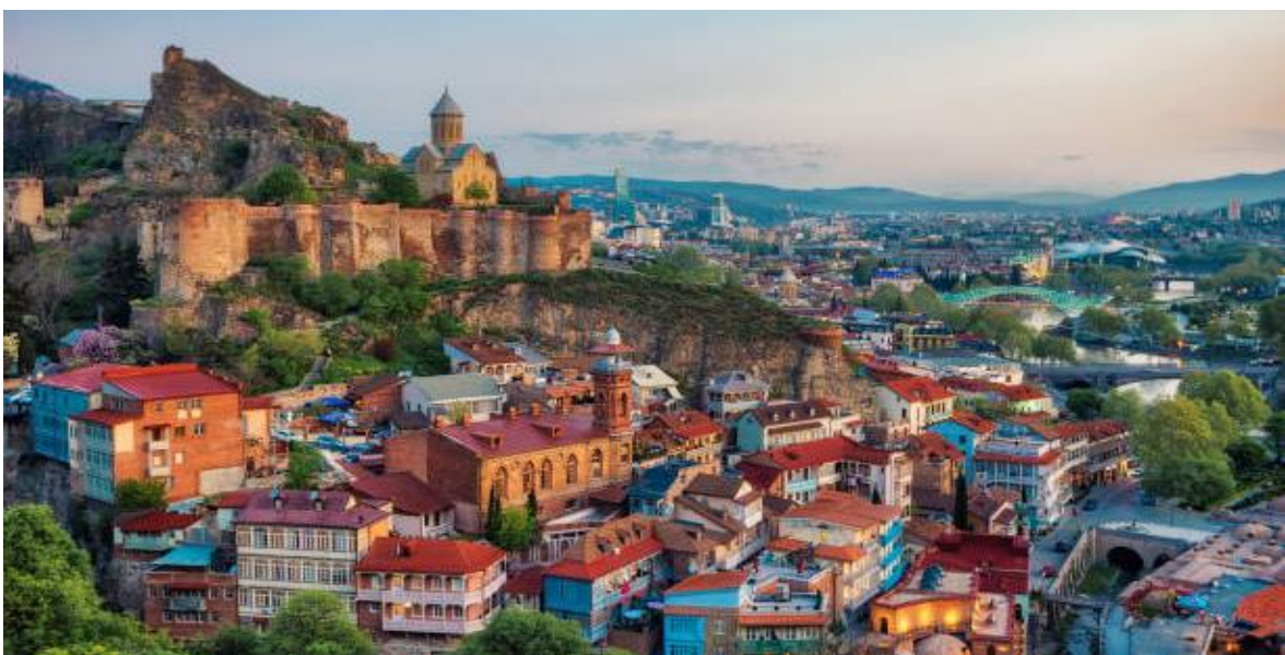
Narikala Fortress / Old town of Tbilisi