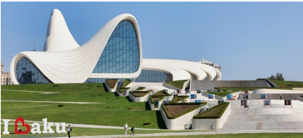
Heydar Aliyev Cultural Center (Architect Zaha Hadid)