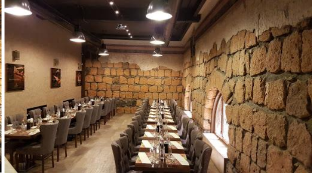
Brandy degustation in Yerevan