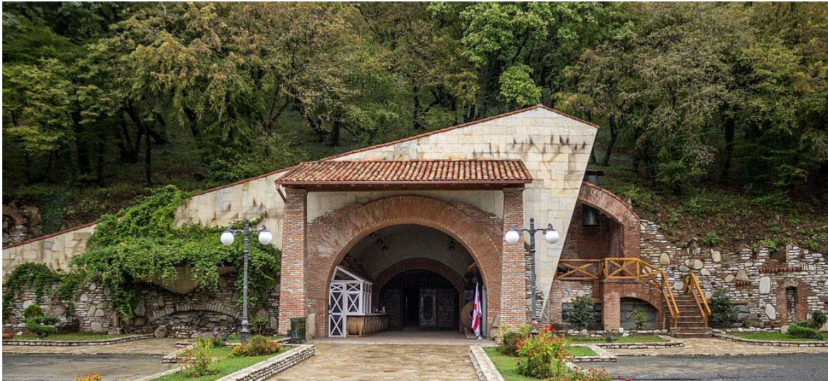
Kvareli Tunnel Winery