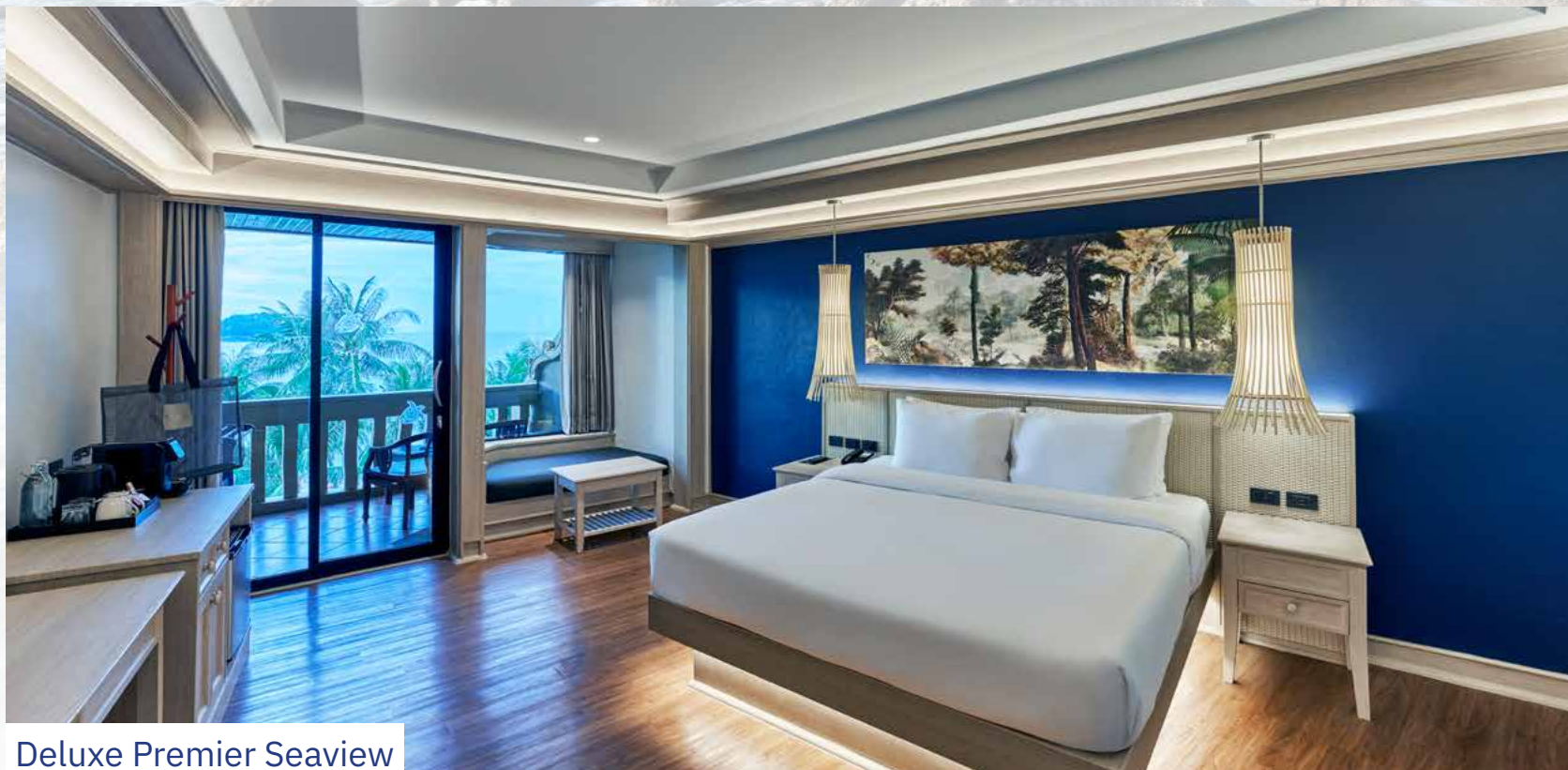
Deluxe Premier Seaview

*image renderings and shown for illustration purposes only.