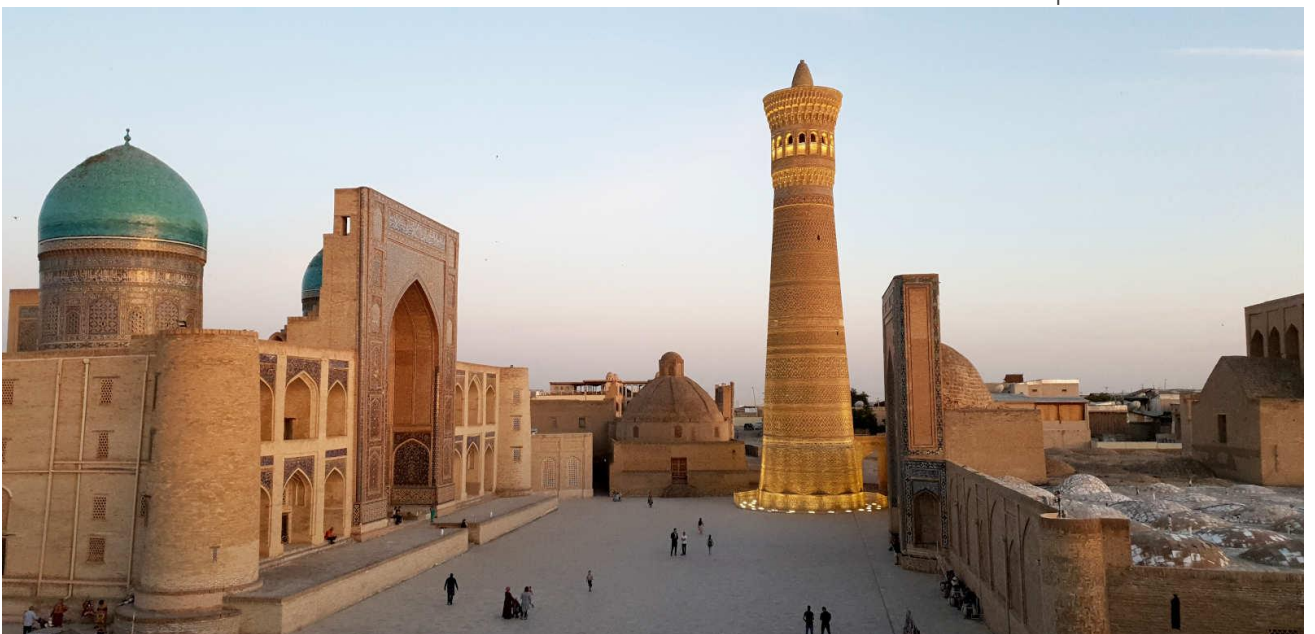
Poi Kalon Square in Bukhara