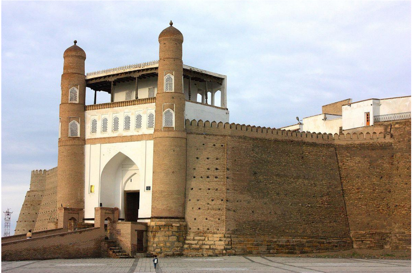
The Ark Citadel in Bukhara