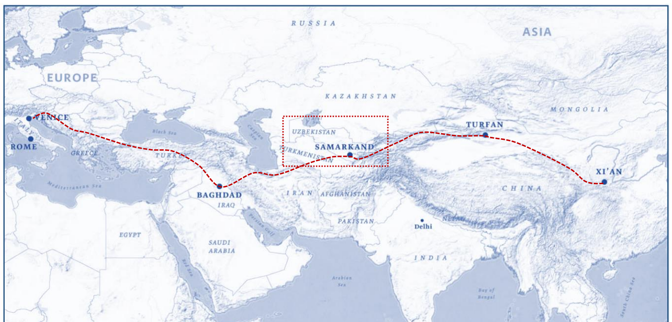
The Silk Road and Uzbekistan

Even more than the Roman Empire, the Silk Road shaped the world we know today. Weaving from Europe to Asia, North to the Indian Subcontinent, and everywhere in between, it was along this network of ancient trading routes that people, ideas, inventions, and goods made their way and at the center of the Silk Road here is Uzbekistan, waiting to be discovered.