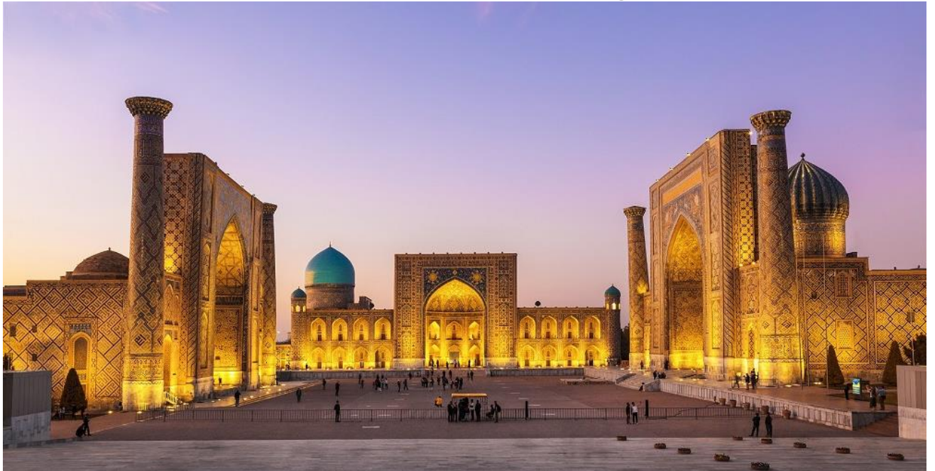
The Registan Square in Samarkand

The Registan Square was the heart of the ancient city of Samarkand of the Timurid Empire. It was a public square, where people gathered to hear royal proclamations, heralded by blasts on enormous copper pipes called dzharchis — and a place of public executions. It is framed by three madrasahs (Islamic schools) of distinctive Islamic architecture. The square was regarded as the hub of the Timurid Renaissance.