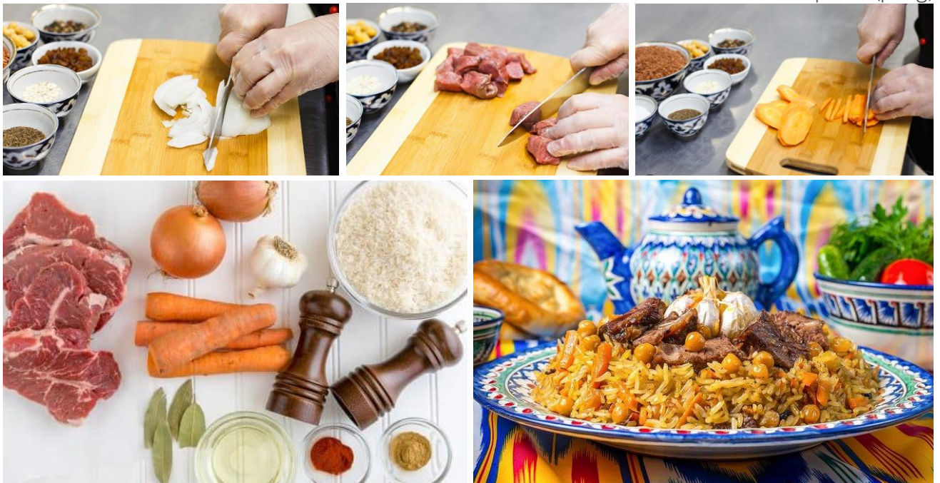
Uzbekistan palov (pilag)