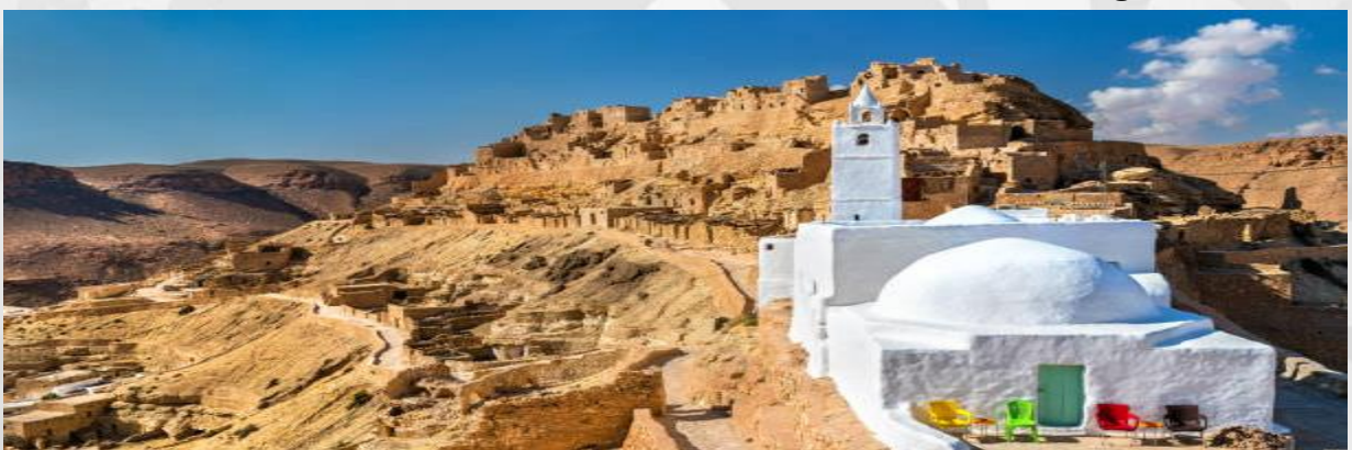
Berber village of Shenini