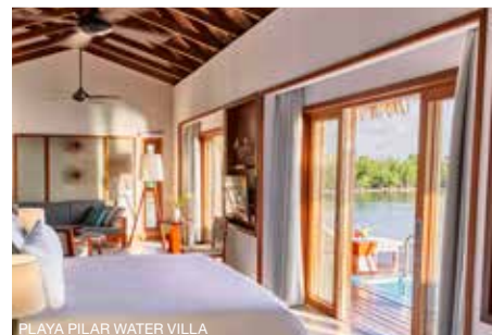
PLAYA PILAR WATER VILLA