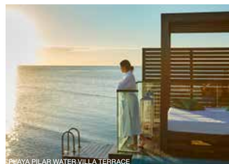
PLAYA PILAR WATER VILLA TERRACE