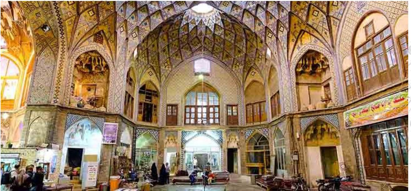
Tehran Grand Bazaar