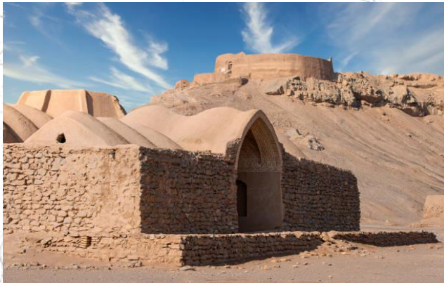
Tower of Silence