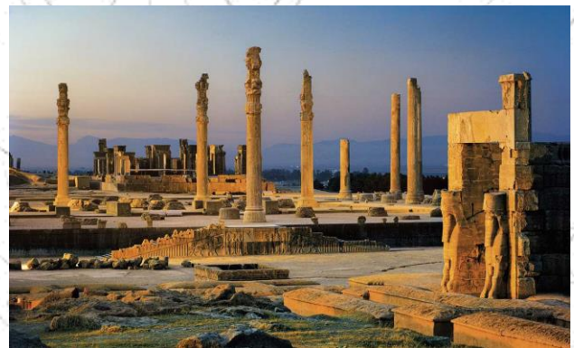
Antient Persia (Persepolis)