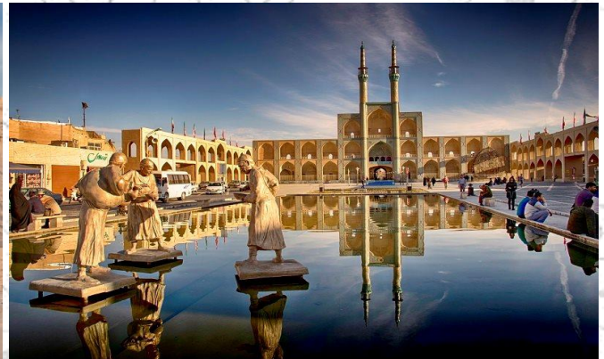
Amir Chakhmaq Square