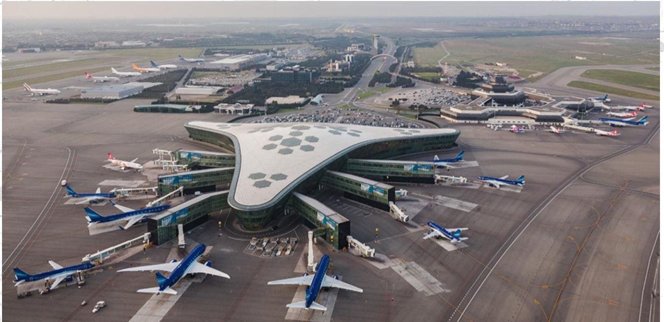
Heydar Aliyev Airport, Baku (5* by Skytrax)

Breakfast at hotel. Transfer to airport for return flight. Kiss and cry. End of the tour and our services.