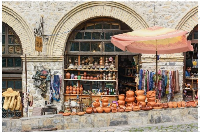
Sheki Old town street