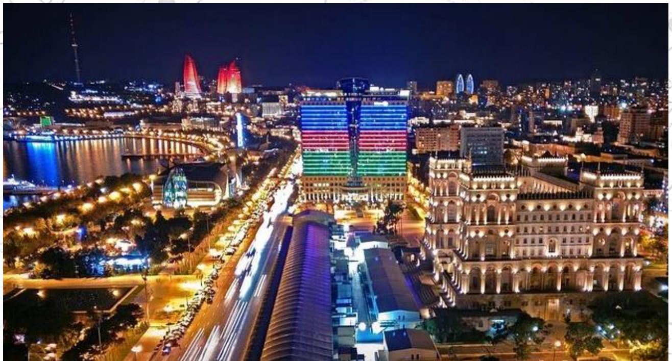
Caspian Sea Bay, Baku (TV tower, Flame Towers, Hilton hotel, House of Parliament)