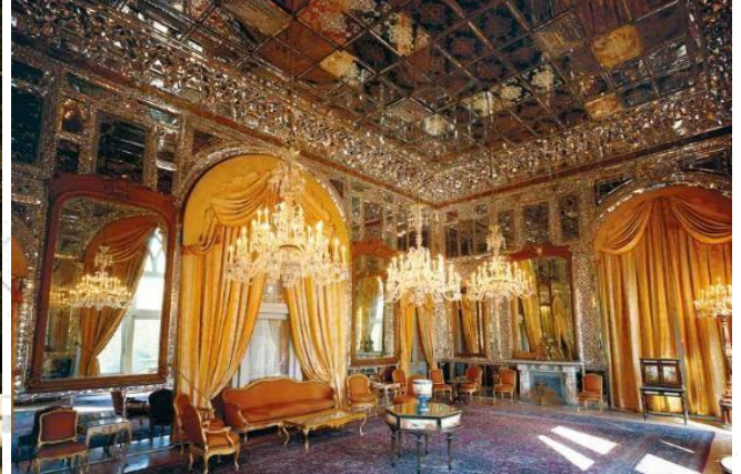
Golestan Palace, Tehran