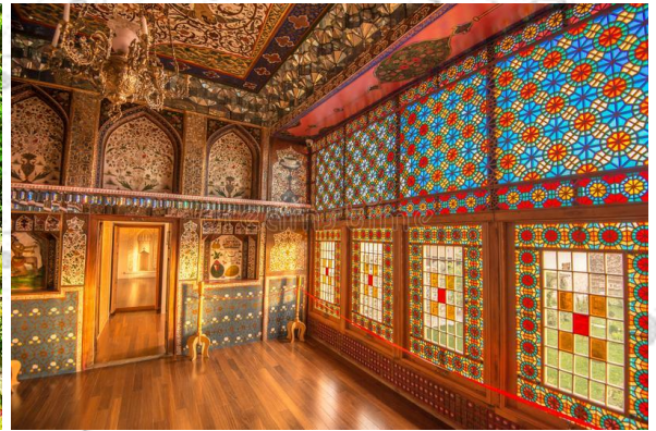
Sheki Khan Saray