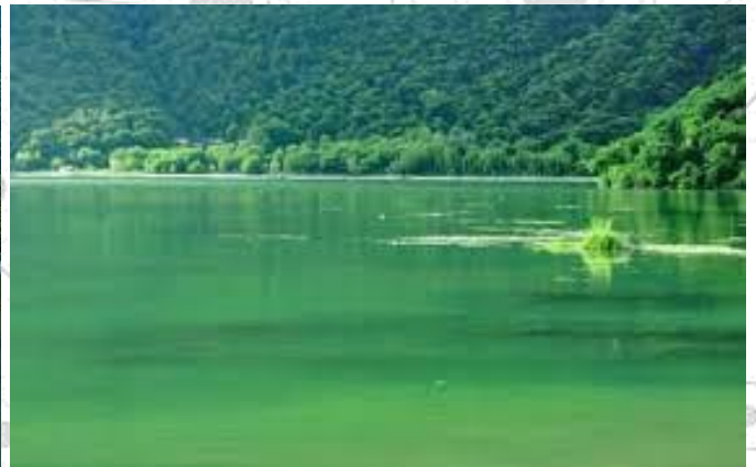
Nohur lake, Gabala