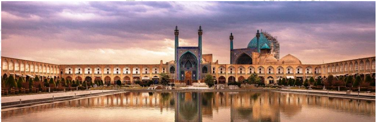
Imam Square, Isfahan