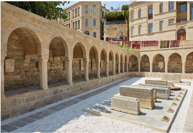
Old town of Baku