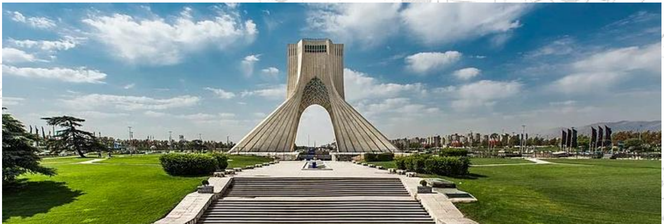
Azadi Tower, Tehran