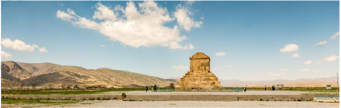
Pasargad (Tomb of Cyrus the Great)