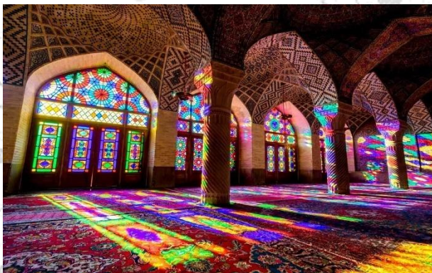
Nasir-al Molk Mosque (Pink Mosque), Shiraz