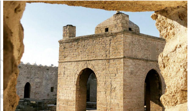
Ateshgah Zoroastrian Temple