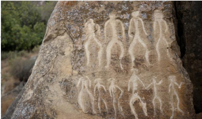
Gobustan Petroglyph Archeological Sight