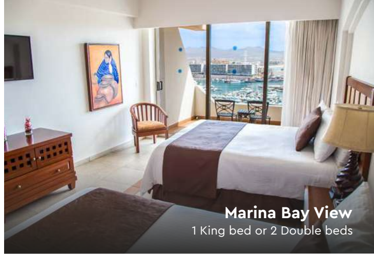
Marina Bay View 1 King bed or 2 Double beds