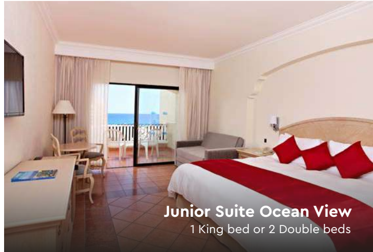
Junior Suite Ocean View 1 King bed or 2 Double beds