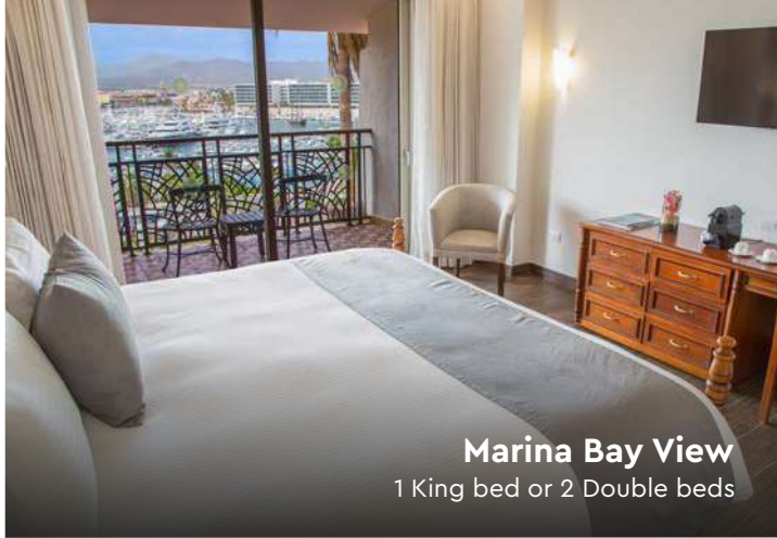
Marina Bay View 1 King bed or 2 Double beds