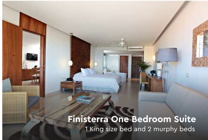
Finisterra One Bedroom Suite 1 King size bed and 2 murphy beds