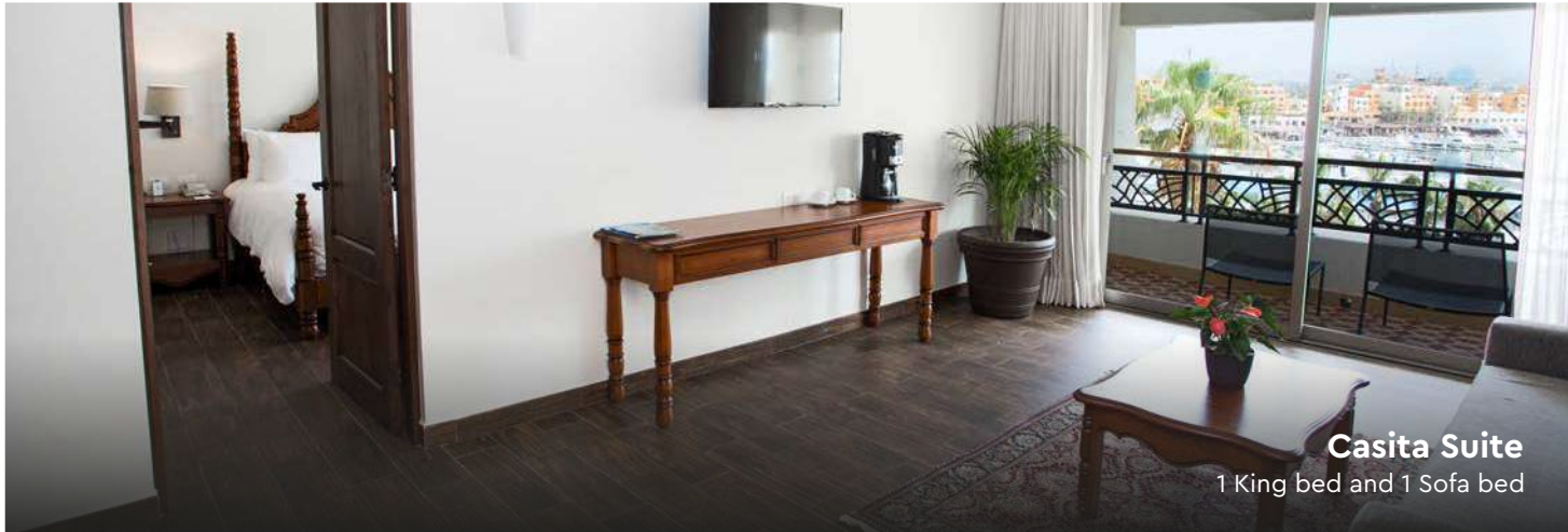
Casita Suite 1 King bed and 1 Sofa bed