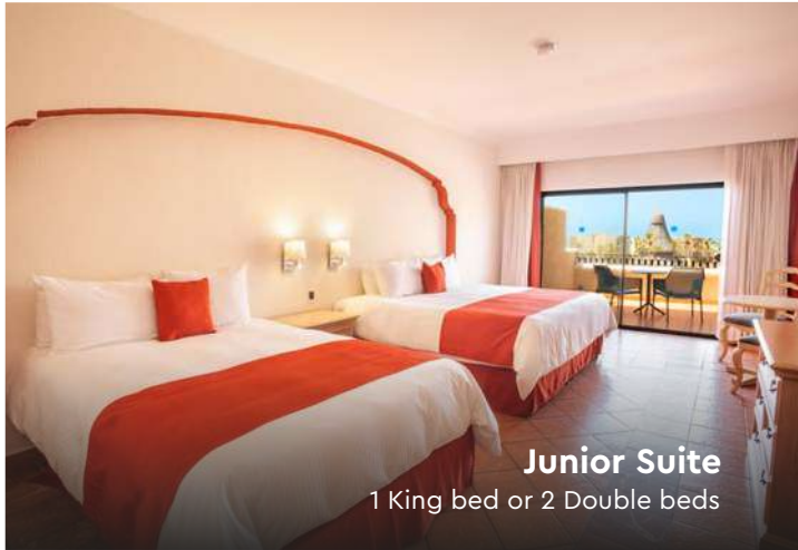
Junior Suite 1 King bed or 2 Double beds