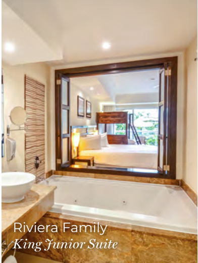
Riviera Family King Junior Suite