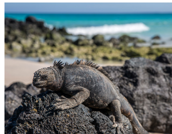
Explore the Galápagos