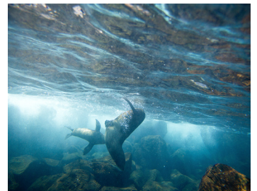
Explore the Galápagos