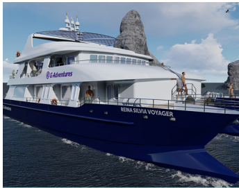
New Galápagos catamaran: Reina Silvia Voyager