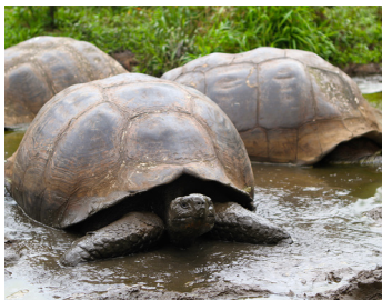
Explore the Galápagos