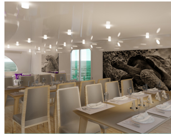
New Galápagos catamaran: Reina Silvia Voyager