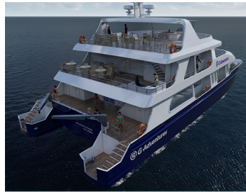
New Galápagos catamaran: Reina Silvia Voyager