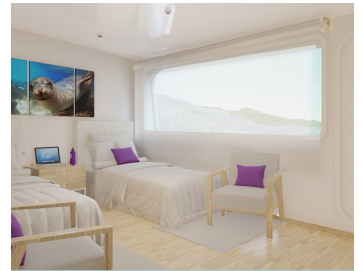
New Galápagos catamaran: Reina Silvia Voyager