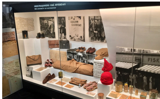
The Dutch Resistance museum - best historical museum in the Netherlands