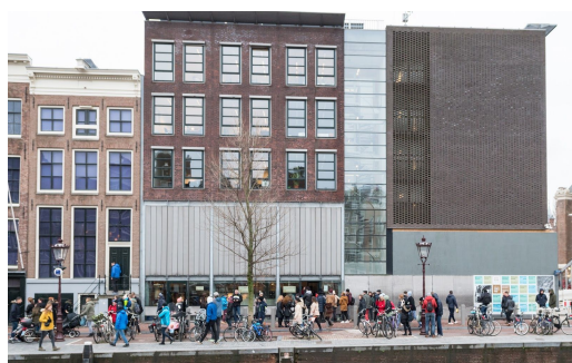
A visit to Anne Frank's House