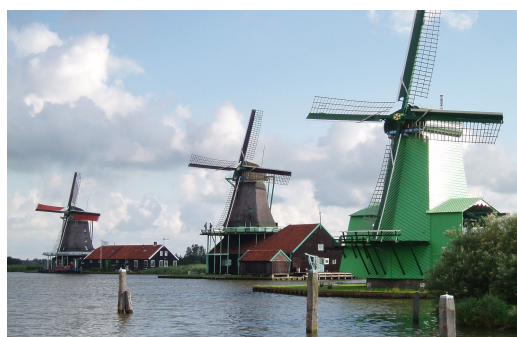
Optional extension to Zaanse Schans

Resistance Museum , awarded as the best historical museum of the Netherlands. Tonight, return to your hotel to enjoy our dinner and overnight at your own pace. [Overnight - Amsterdam 3* Centrally Located TBC (B)]