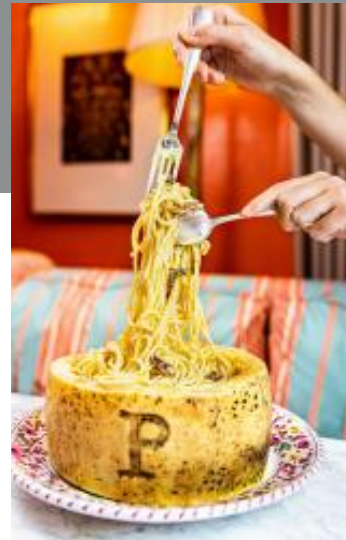
LA DOLCE VITA trattoria