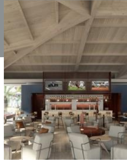
CHAMPS • SPORTS BAR •