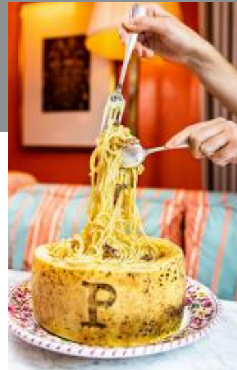
LA DOLCE VITA