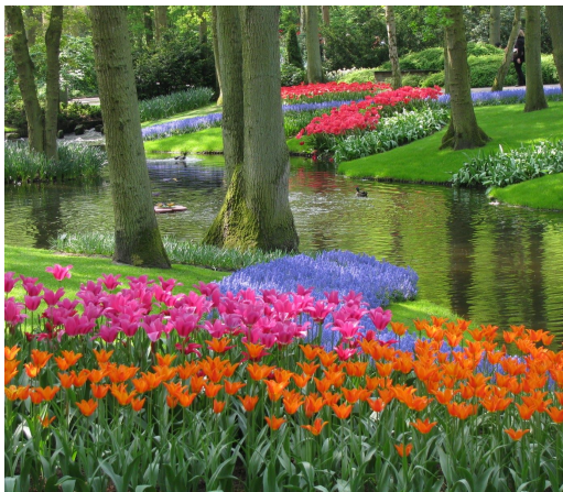
A visit to the Keukenhof Gardens