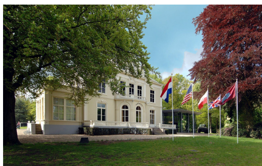
The Hartenstein Hotel