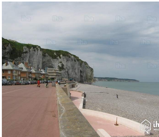
Exploring the seaside town of Dieppe