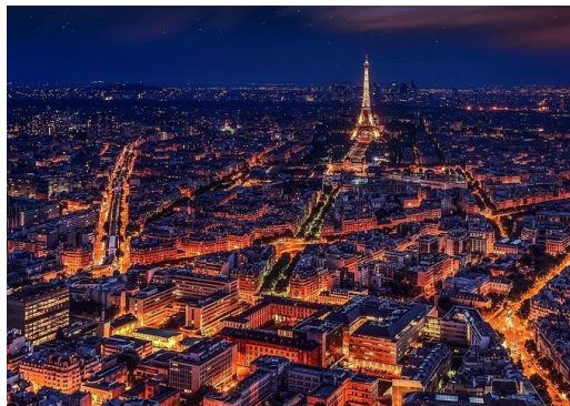
Arrival into the City of Light - Paris