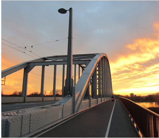
The John Frost Bridge, Arnhem