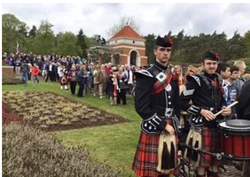
Canadian Ceremony in Holten

Canada Poland Museum. Upon our arrival into Arnhem , we will see the John Frost Bridge , (A Bridge Too Far). As we drive to our hotel along the Benedendorpsweg we will see some of the main sights of the Battle of Arnhem including the Stationsweg , the White House , Hackets Hollow , the Kate ter Horst house , Lonsdale church , and the original Railroad Bridge . We arrive in time for some rest and relaxation before our " Welcome Dinner ", where we will have the opportunity to meet other Canadian traveling companions.[Overnight - Van der Valk Hotel, Arnhem or similar (B, D)]