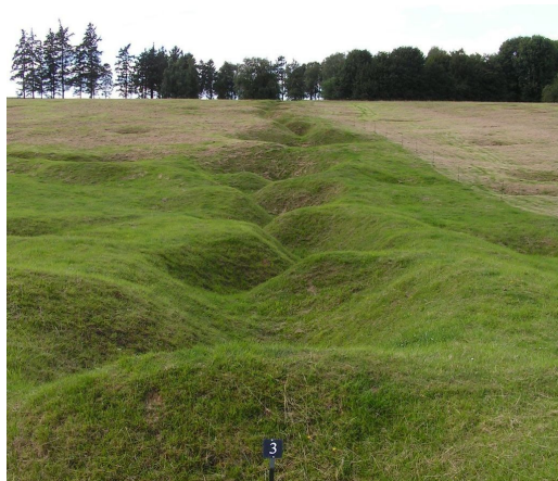
Beaumont Hamel - largest preserved battlefield in the world

museum, and bunkers. Enroute today, we will also visit Abbayes des Ardennes , to see the Canadian Memorial Garden, as well as Point 67 , to discuss the devastating Battle of Verrieres Ridge . We end the day with a solemn visit to the Beny-sur-Mer Canadian Military Cemetery . Tonight, we return to St. Aubin for our dinner and overnight. [Overnight - Aubin sur Mer 2* Superior Class Centrally Located or similar (B, D)]