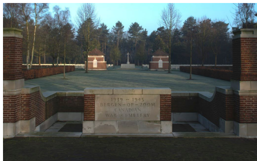
A visit to Bergen-Op-Zoom Cemetery