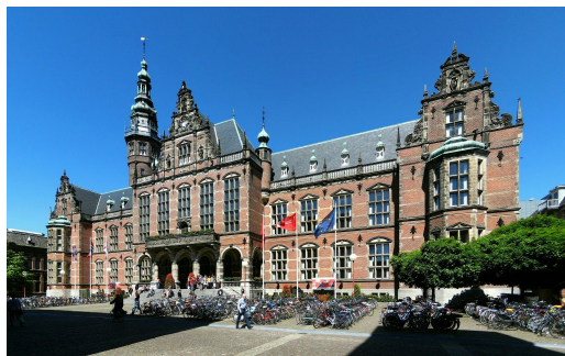
Liberation in Groningen

commander general Blaskowitz met with Canadian general Foulkes, here, at the Hotel de Wereld . There they negotiated the surrender document for all German forces in the Netherlands. [Overnight - Van der Valk Hotel, Arnhem or similar (B, D)]