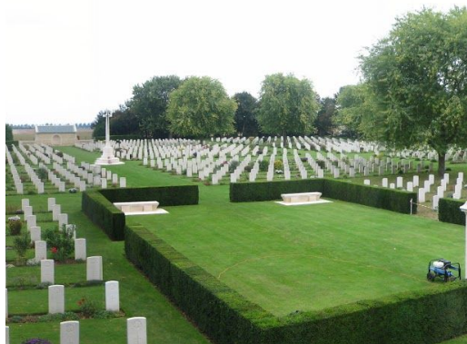
A visit to Beny-sur-Mer Canadian Cemetery