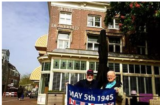
A visit to Hotel de Wereld, Wageningen