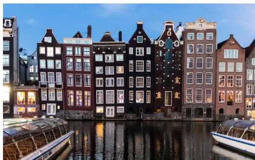
Depart from AMS Schiphol, or extend your stay in Amsterdam

Activities on this itinerary may change due to 2019 schedules which are yet to be finalized.