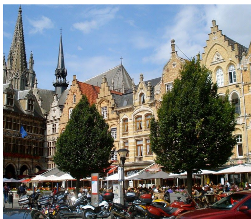
Ypres - the City for Peace & surrounding Salient

as “Canada’s Forgotten Battle”. In the afternoon, we continue to Vimy Ridge Memorial Park . It was here, at Hill 145, on April 1917, that Canada truly became a nation in the eyes of the world. Its troops combined and stormed Vimy Ridge after all other allied forces had failed to do so. We will tour the tunnels, trenches and memorial, as well as the brand new interpretation centre, which opened in Spring 2017 for the 100th Anniversary. When our explorations of the battlefields are through, we continue on to Ypres the City of Peace. After checking into our hotel we will enjoy an early group meal together in the heart of Ypres’ Grote Markt . Tonight, at 8PM, we will witness the iconic and historic Last Post Ceremony , at the Menin Gate Memorial to the Missing , led by the leper Fire Department & the Last Post Association. This daily act of homage is among the most memorable acts of remembrance that we will witness on our tour. [Overnight - Ypres 4* Centrally Located TBC (B, D)]