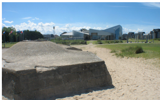
A visit to the Juno Beach Center in Normandy