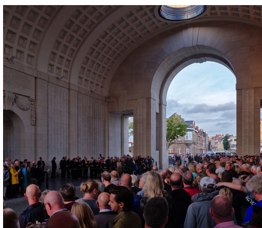
The Last Post Ceremony in Ypres, Belgium