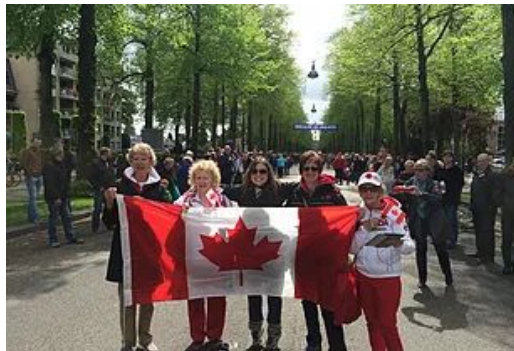
The Thank You Canada Celebrations in Apeldoorn