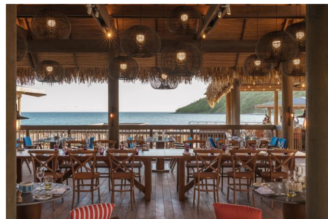
Fisherman's Village, Ocean-to-Table Cuisine