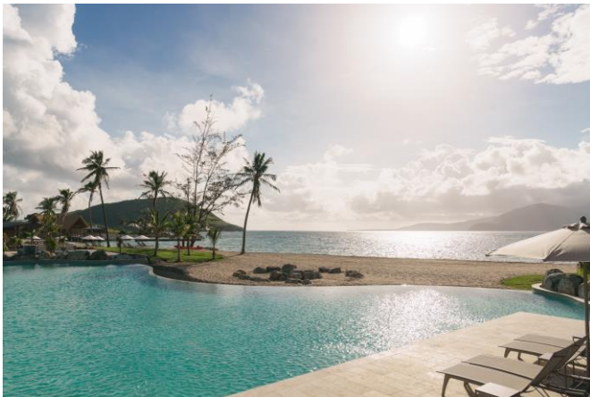
Park Hyatt St. Kitts Lagoon Family Pool

Set within the ultra-luxury Christophe Harbour development on Banana Bay in the most natural and untouched region of this beautiful island, Park Hyatt St. Kitts, a luxury resort, introduces the unparalleled Park Hyatt experience for discerning leisure travelers and incentive groups to this idyllic dream destination in the West Indies.