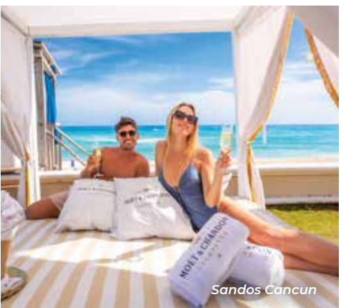
Enjoy adults-only exclusivity with themed parties, gourmet dining, and luxurious oceanview suites designed for pure relaxation.