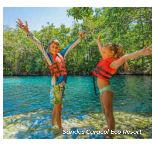
Discover cenotes, lush rivers, and a water park while immersing yourself in the vibrant jungle and underwater wonders.