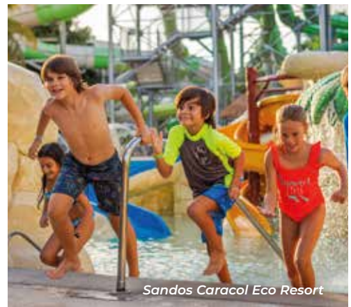
Ideal for family trips, with strategic locations so you don't miss out on the best moments with total relaxation.