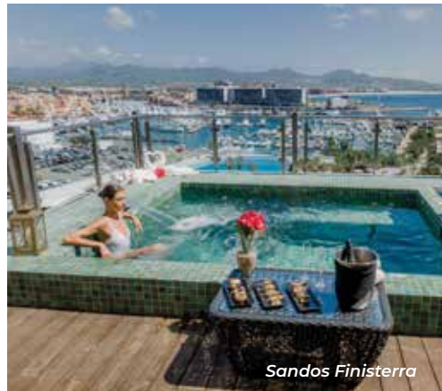
Discover the perfect setting for couples with breathtaking Pacific views, romantic dining experiences, a world-class spa, and beautiful suites, where every detail invites relaxation and connection.