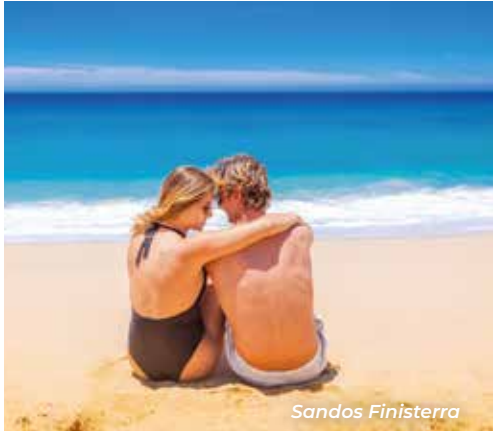
The vastness of ur white-sand beaches and soothing sea breeze make the perfect spot for unwinding in the sun.