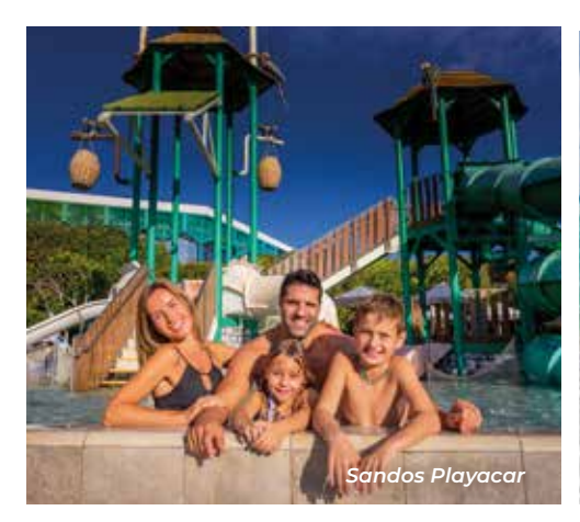
Perfect vacations for the whole family with endless activities, music, gastronomy, and small water parks.