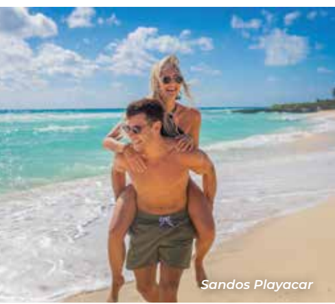
Located on incredible white sandy beaches that contrast with the infinite variety of blue and turquoise shades of the Caribbean Sea.