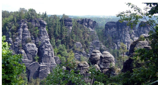
The Elbe Valley