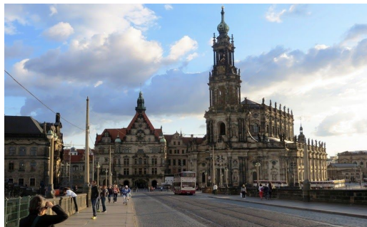
Overnight in Dresden