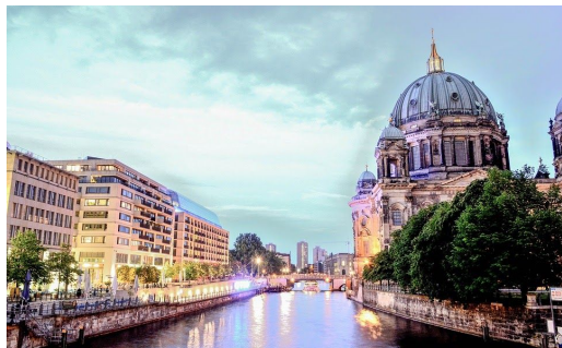
Departure from Berlin

Activities on this itinerary may change due to 2019 schedules which are yet to be finalized.