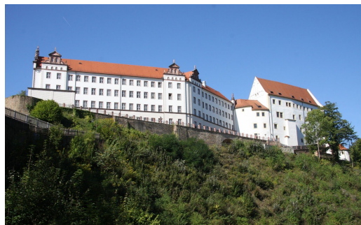
Exploring Colditz Castle