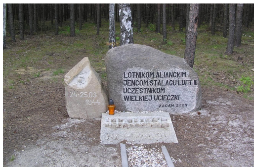
The Great Escape - Zagan Poland