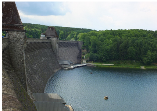
From Arnhem, we depart for Germany - stopping at the Mohne Dam in the Ruhr Valley