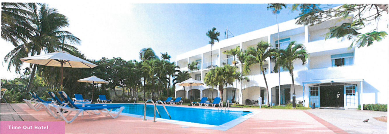
Time Out Hotel