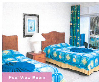
Pool View Room