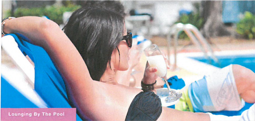
Lounging By The Pool