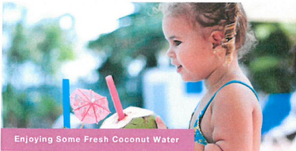
Enjoying Some Fresh Coconut Water

Time Out Hotel is located in the St. Lawrence Gap area, the capital of Barbados' nightlife, and close to the white sands of Dover Beach.