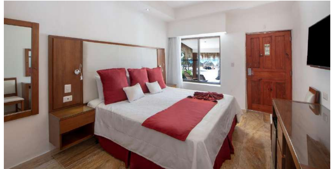
Ocean Front Bungalows