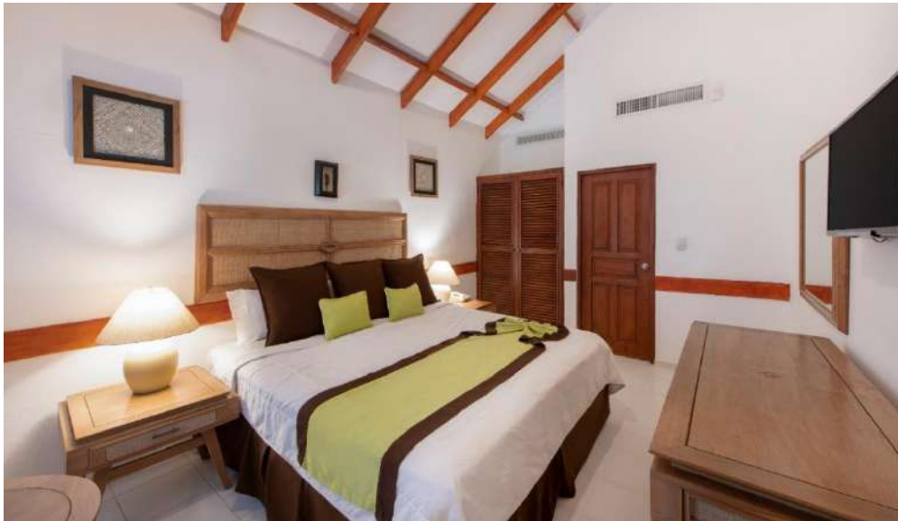
Garden View Bungalows