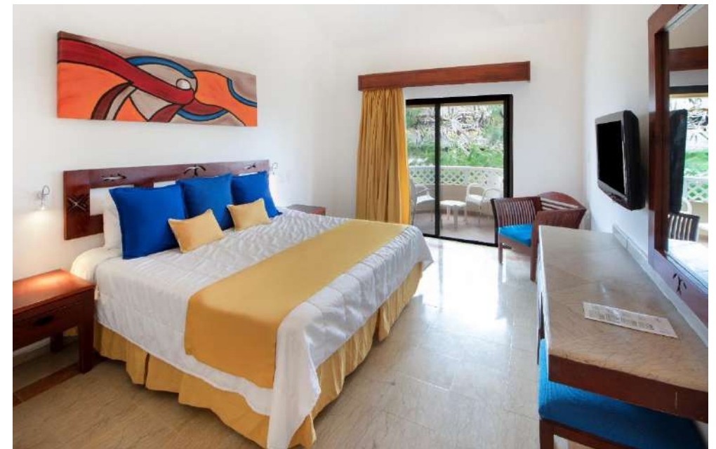
Superior Garden View