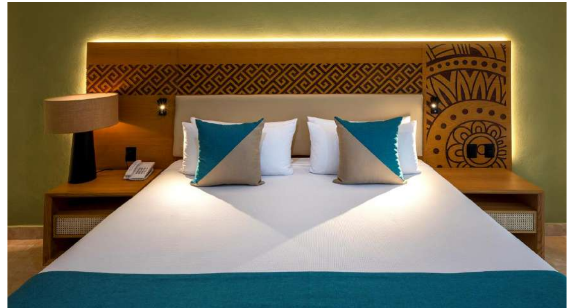
Superior Ocean Front - Honeymooners