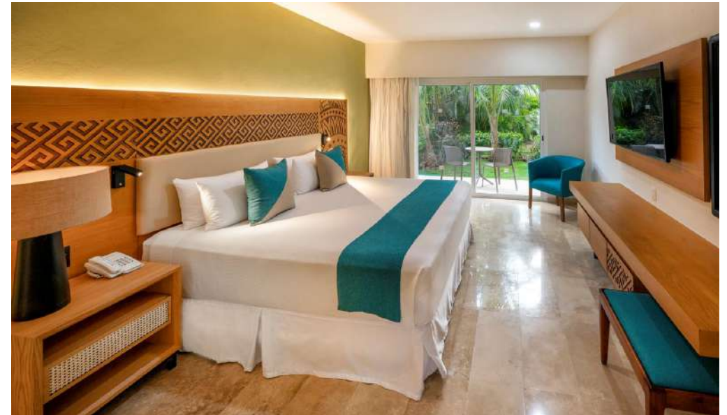
Superior Garden View