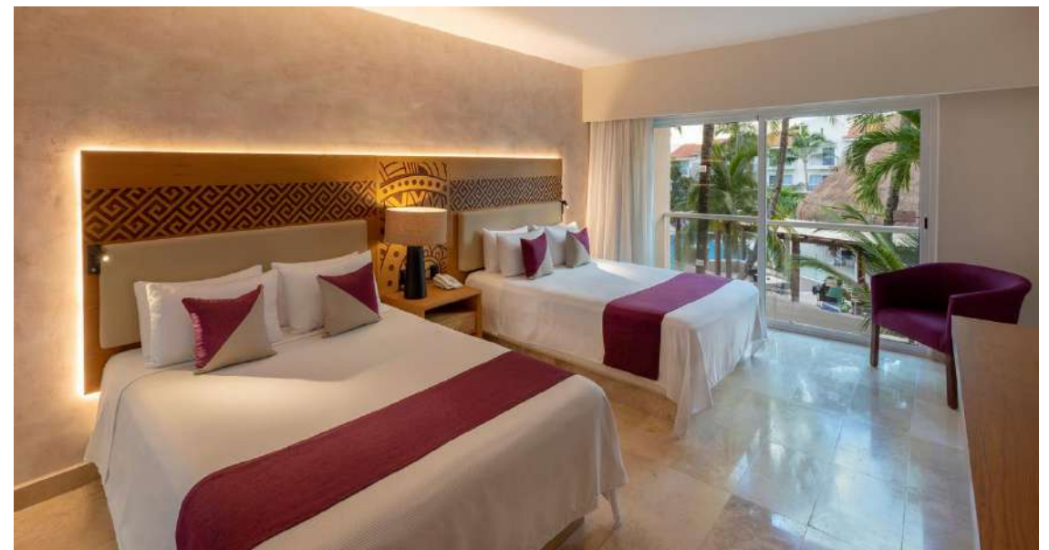
Superior Pool View