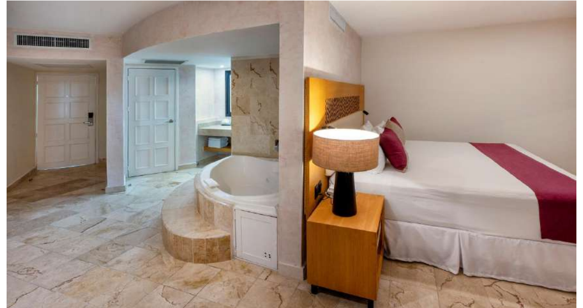
Superior Ocean Front - Honeymooners