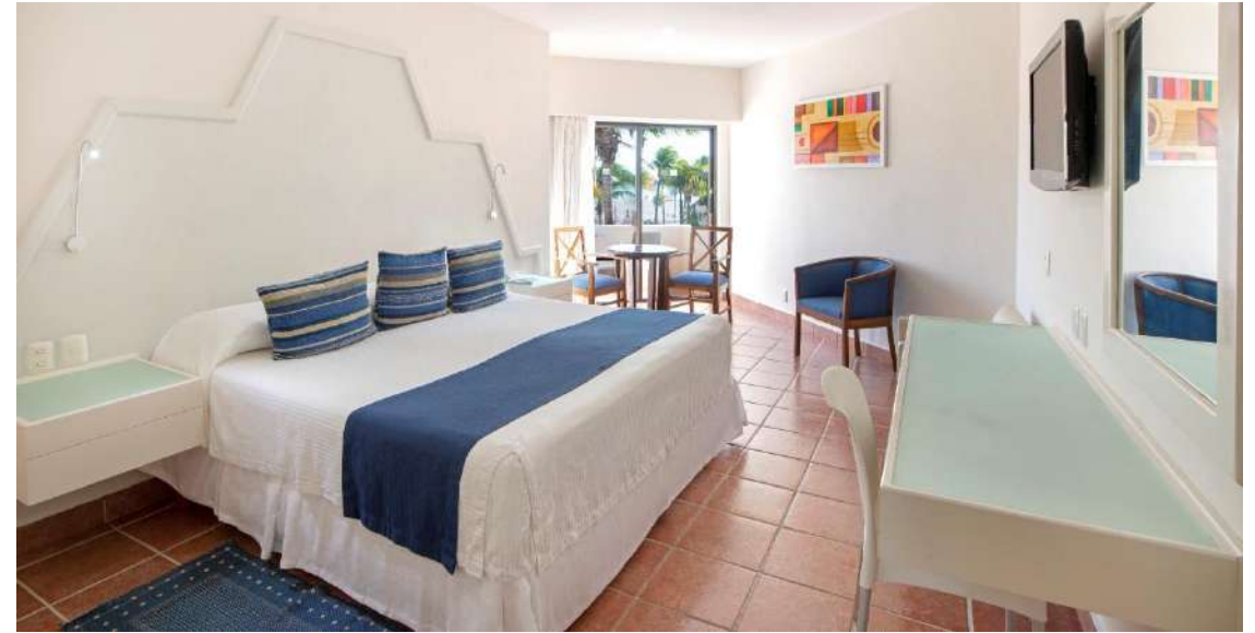
Superior Ocean View