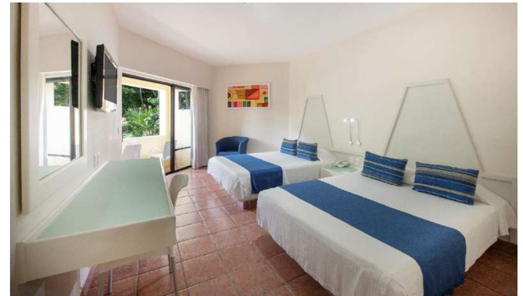
Superior Garden View