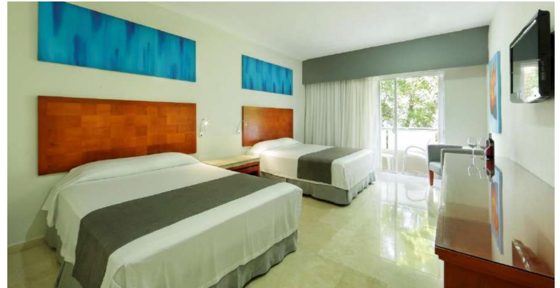
Deluxe Garden View