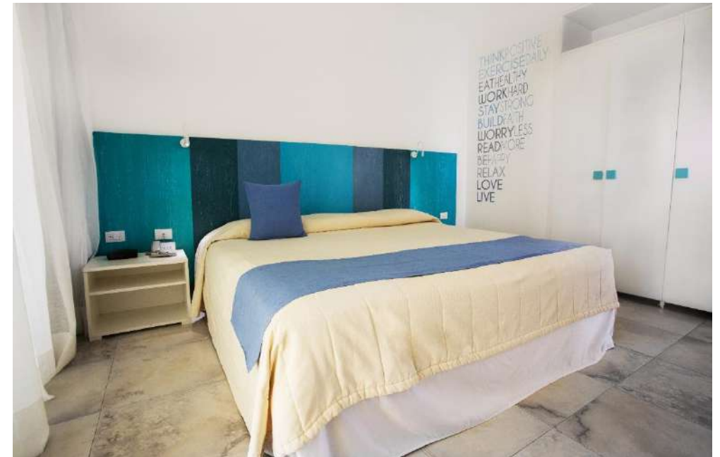
Superior Garden View