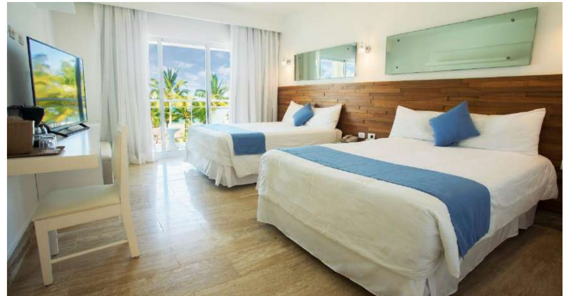
Superior Ocean View