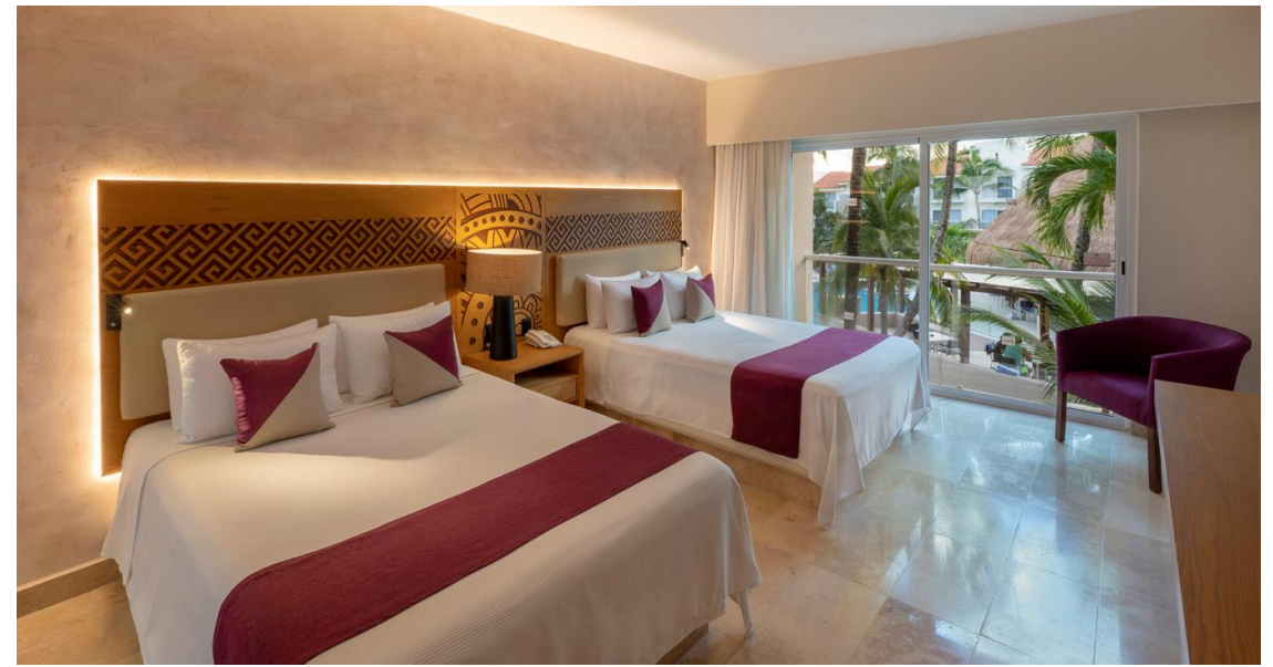
Superior Pool View