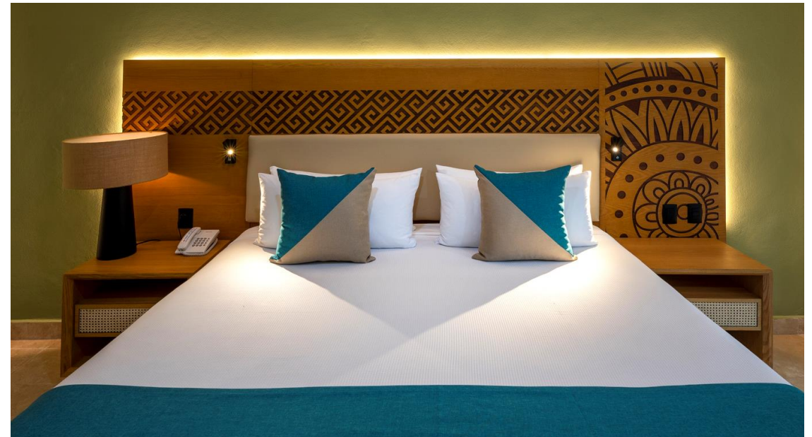
Superior Ocean Front - Honeymooners