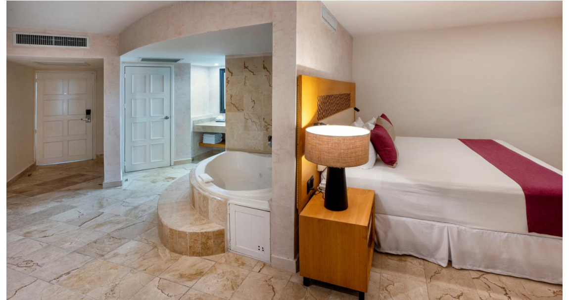
Superior Ocean Front - Honeymooners