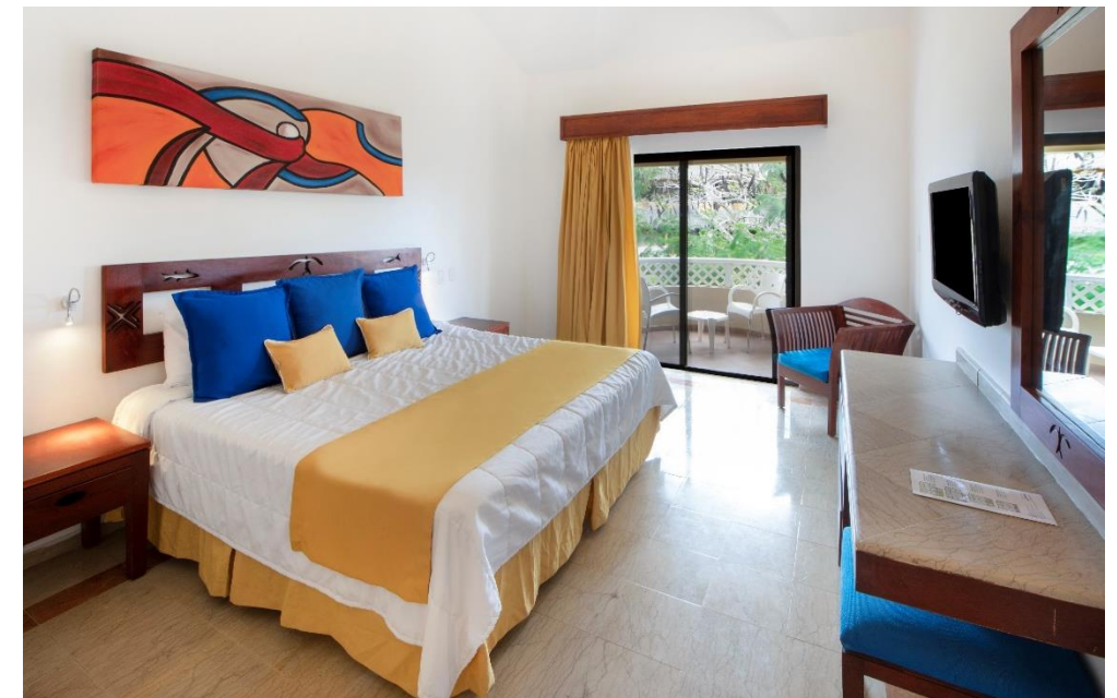
Superior Garden View