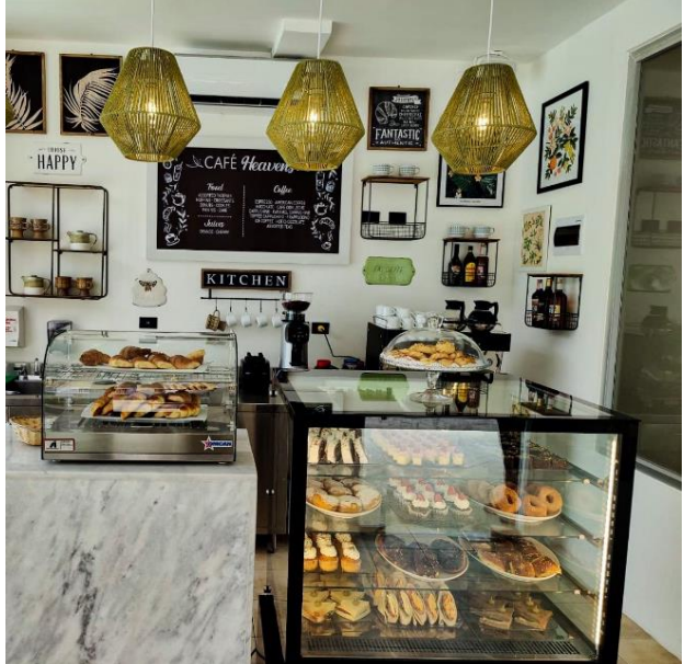
NEW CAFÉ HEAVENS