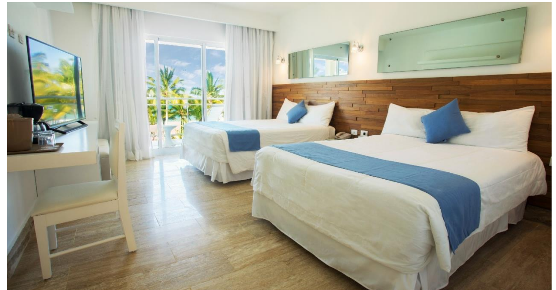
Superior Ocean View