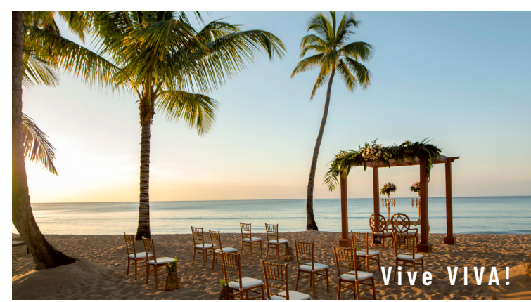
BEACH, WE LOVE YOU

Can you feel the golden sands of Coson beach under your feet? Look up from your chair lounge and gaze at the sky scraping palm trees while you are sedated by the warm ocean breeze and forget everything you knew about all-inclusive resorts. Viva V Samaná by Wyndham represents a total reboot.