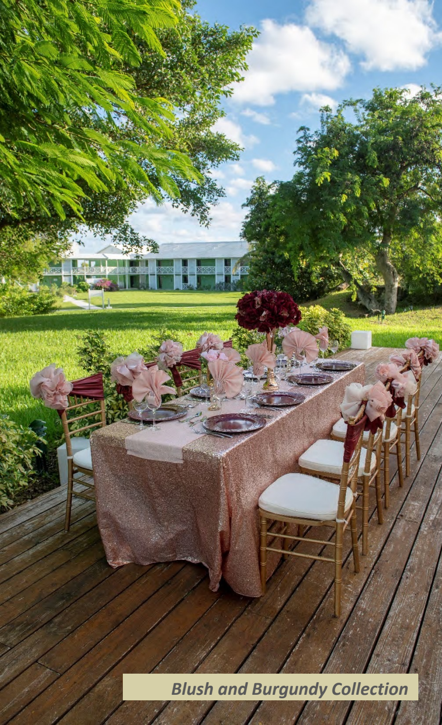
Blush and Burgundy Collection